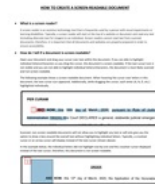
How to Create a Screen-Readable Document