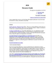
National Center for State Courts ADA Resource Guide